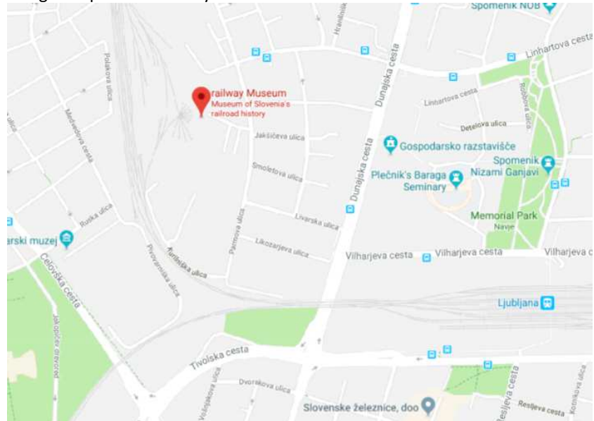
Google map of the Railway Museum

Railway Museum Parmova 35 1000 Ljubljana